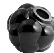
Berry Tales Black