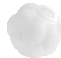
Berry Tales White Frosted