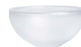
Beans Bowl Frosted