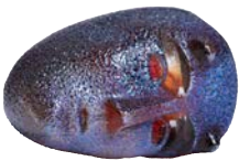
Go for it

7520155 L 45 H 75 B 55 MM GREEN/ TURQUOISE