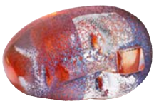
I see you

7520158 L 45 H 75 B 55 MM SILVER/ AMBER/ ORANGE