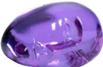
I dreamed of a blue horse

7520164 L 45 H 75 B 55 MM NEODYMIUM/ SILVER