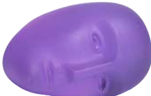
You made my day

7520166 L 45 H 75 B 55 MM NEODYMIUM/ BLASTED