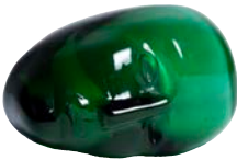
Walk with me

7520155 L 45 H 75 B 55 MM GREEN/ TURQUOISE