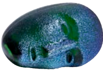
Remember the blue sky