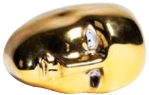
Everything is better when we dance

7520162 L 45 H 75 B 55 MM CLEAR/ BLASTED