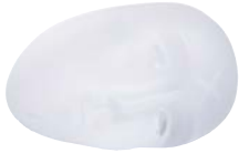
You are the light

7520162 L 45 H 75 B 55 MM CLEAR/ BLASTED