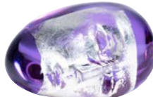
All is well

7520164 L 45 H 75 B 55 MM NEODYMIUM/ SILVER