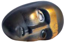
You exist - here and now

7520159 L 45 H 75 B 55 MM BLUE/ RED/ BLASTED